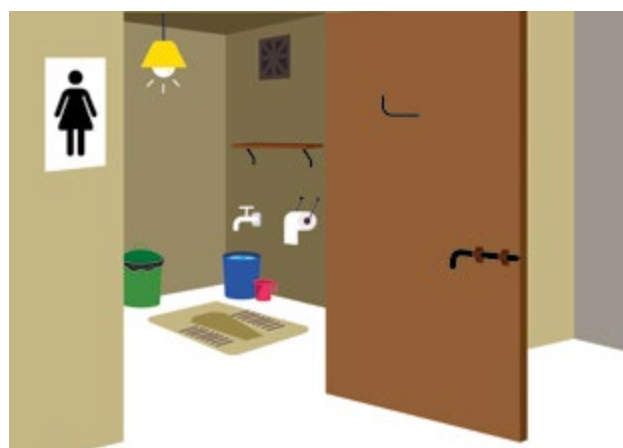
Figure 3: An example of the interior of a female-friendly toilet cubicle.