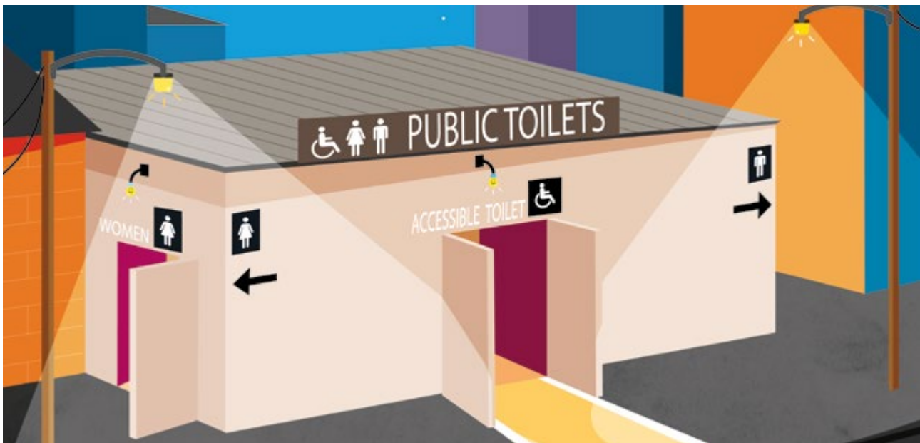
Figure 1: An example of the exterior of a female-friendly toilet block.

Female-friendly public and community toilets: a guide for planners and decision makers aims to help local authorities, planners and others responsible for sanitation provision to better understand the requirements of women and girls using public and community toilets. The guide will support them to meet these requirements, with practical suggestions for planning, implementation and operational processes. This briefing note presents the highlights of the guide and an overview of the subject of female-friendly toilets.