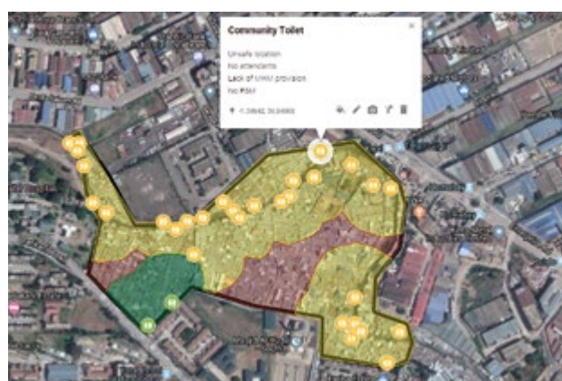
Results of a mapping exercise of community toilets in Mathare, Kenya.

The guide provides a checklist of elements to consider in construction or upgrading, operation and maintenance, and monitoring phases.