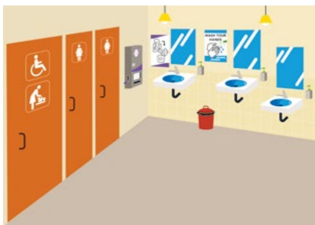
Figure 2: An example of the interior of a female-friendly toilet block.